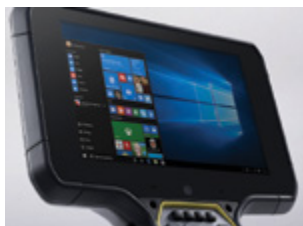
Windows 10 Pro OS