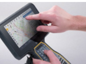
7" multi-touch screen